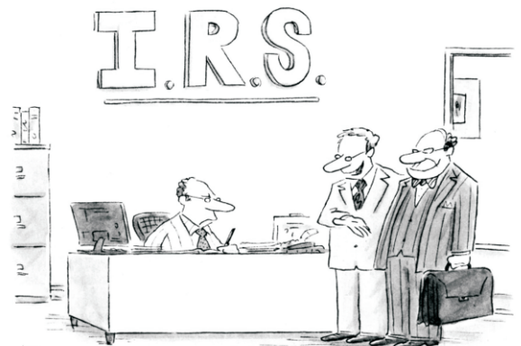
"Taxation, meet Representation"